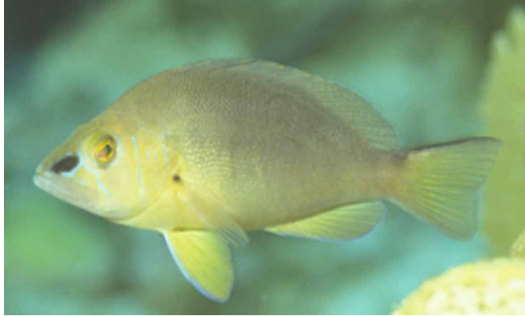
FIGURE 5. Hypoplectrus randallorum , paratype: MCZ 169203, 91.4 mm SL, Glovers Atoll, 10 m depth, ocean side reef, spear, 21 July 1999, P. S. Lobel and J. E. Randall.

caudal-peduncle depth 14.0 (13.6–14.2); caudal-peduncle length 11.8 (9.9–13.8); predorsal length 43.3 (42.4–46.4); preanal length 22.1 (16.8–26.9); prepelvic length 42.8 (40.7–44.9); base of dorsal fin 55.4 (49.8–57.7); longest dorsal spine 16.7 (16.1–17.3); base of anal fin 18.8 (16.5–20.7); longest anal spine 14.6 (13.9–15.6); longest anal ray 18.2 (15.3–20.4); caudal fin length 22.8 (21.4–25.9); pectoral fin length 32.1 (31.9–32.4); pelvic fin length 25.9 (22.4–28.6).