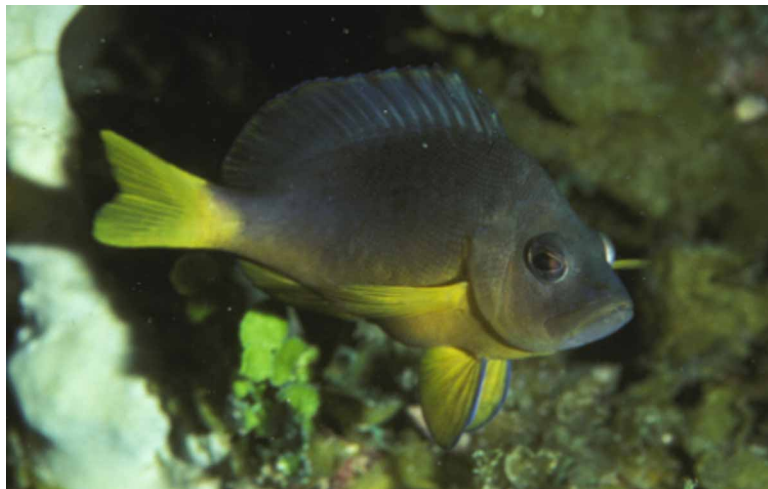
FIGURE 10. H. aberrans , Jamaica.