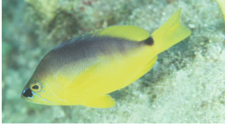
FIGURE 15. H. maculiferus , St Barth's.