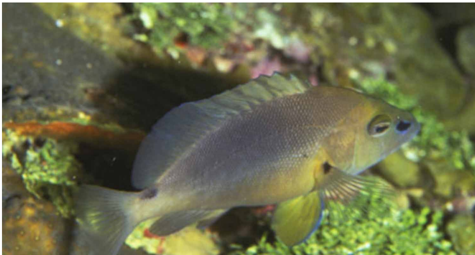
FIGURE 6. Hypoplectrus randallorum , Belize.

Other characteristics similar to congeners as described above.