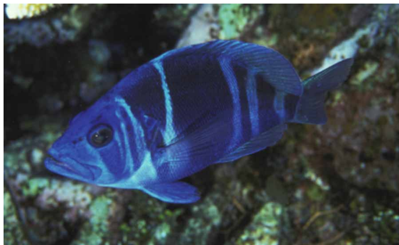
FIGURE 14. H. indigo , Belize.