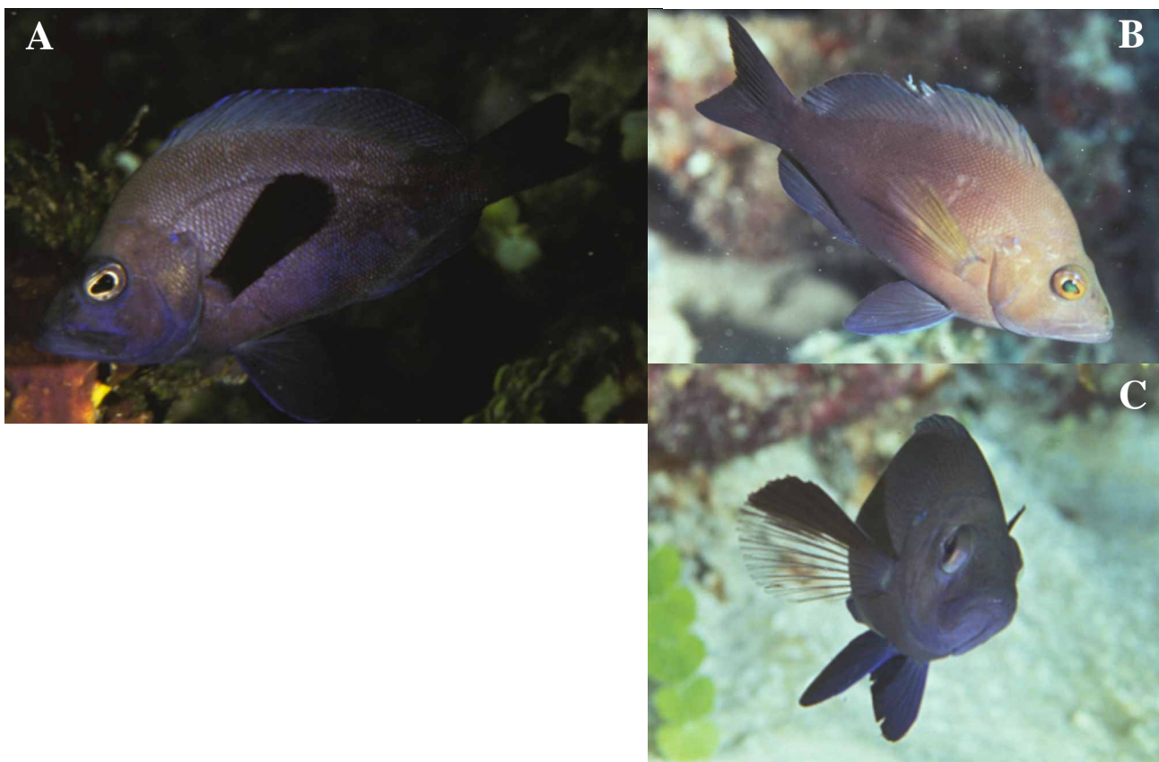
FIGURE 8. Color variations in H. nigricans . The notable difference is the coloration of the pectoral fin. A) Jamaica, B) Jamaica, C) Belize.