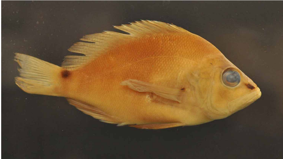
FIGURE 7. Hypoplectrus randallorum . Holotype MCZ 169250, preserved specimen.

spread in the western Caribbean from the West Indies to Central America (Heemstra et al. 2002, Aguilar-Perera & Gonzalez-Salas 2010, Holt et al. 2010). Although its body coloration can sometimes be dark, H. randallorum differs from the black hamlet by having nose spots. There are several variants of the black hamlet, H. nigricans that differ in the coloration of their fins and slightly in some body proportions (Aguilar-Perera 2004). Puebla et al. (2008) proposed, based on DNA data, that H. nigricans may actually represent several different lineages that have independently evolved from an ancestral H. puella stock during multiple evolutionary events. Three different color variants of H. nigricans that have been described by Aguilar-Perera (2004) are shown in Fig. 7.