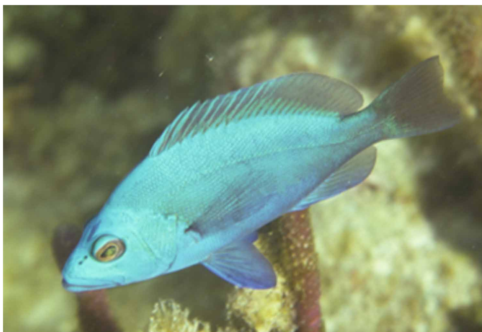
FIGURE 1. Hypoplectrus maya , paratype MCZ 169200, 68.1mm SL, Tunicate Cove, Pelican Cays, 10 November 1994, 3m depth, reef and seagrass.

Paratypes: MCZ 169194, 73.5 mm SL, Tunicate Cove, Pelican Cays, 9 Dec. 2001, 3m depth, reef and seagrass, spear, P. S. Lobel; MCZ 169195, 87.2 mm SL, Tunicate Cove, Pelican Cays, 9 Dec. 2001, 3m depth, reef and seagrass, spear, P. S. Lobel; MCZ 169197, 70.0 mm SL, Tunicate Cove, Pelican Cays, 9 Dec. 2001, 3m depth, reef and seagrass, spear, P. S. Lobel; MCZ 169198, 86.0 mm SL, Tunicate Cove, Pelican Cays, 7 July 1999, 3m depth, reef and seagrass, spear, P. S. Lobel and J. E. Randall (GenBank AY262250); MCZ 169199, 82.9 mm SL, Tunicate Cove, Pelican Cays, 7 July 1999, 3m depth, reef and seagrass, spear, P. S. Lobel and J. E. Randall (GenBank AY262251). MCZ 169200, 68.1mm SL, Tunicate Cove, Pelican Cays, 10 November 1994, 3m depth, reef and seagrass, spear, P. S. Lobel, photographed underwater (GenBank AY262249). MCZ 169201, 94.4 mm SL, collected with holotype. MCZ 169202, 57.6 mm SL, Tunicate Cove, Pelican Cays, 26 March 1997, 3m depth, reef and seagrass, spear, P. S. Lobel and J. E. Randall.