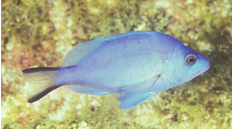
FIGURE 3. Hypoplectrus gemma , Conch Reef, Florida Keys.