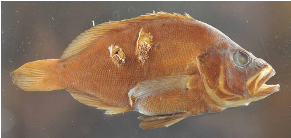
FIGURE 4. Hypoplectrus maya , holotype MCZ 169196, preserved specimen.