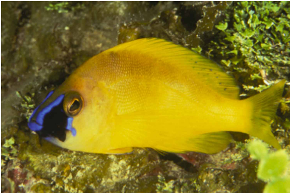
FIGURE 12. H. gummigutta , Jamaica.