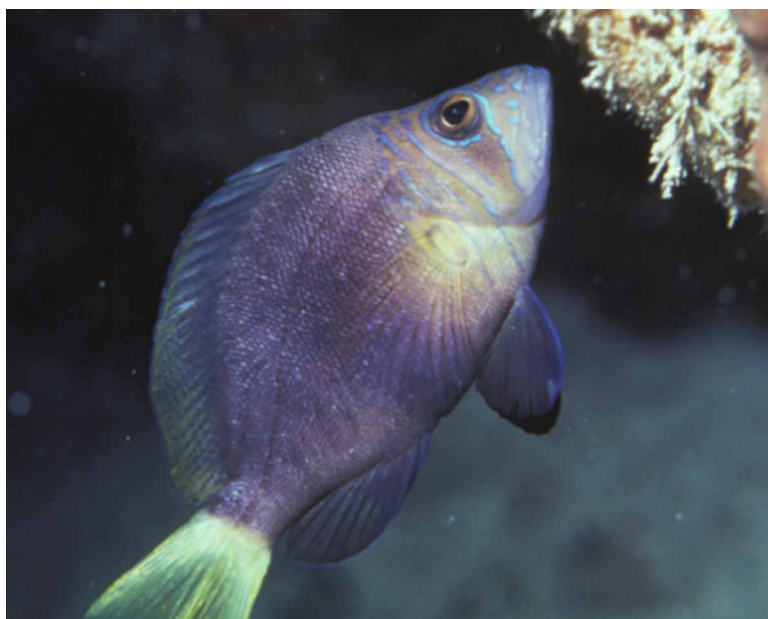
FIGURE 11. H. chlorurus , St. Croix.