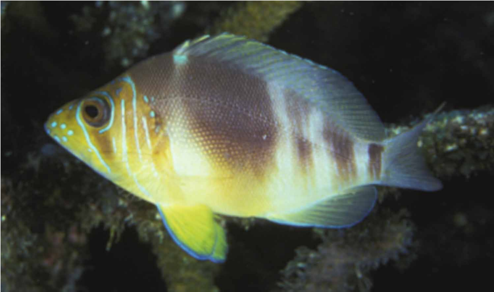
FIGURE 16. H. puella , Belize.