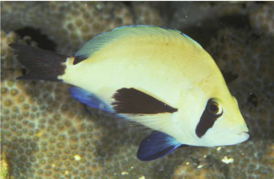
FIGURE 17. H. providencianus , Jamaica.