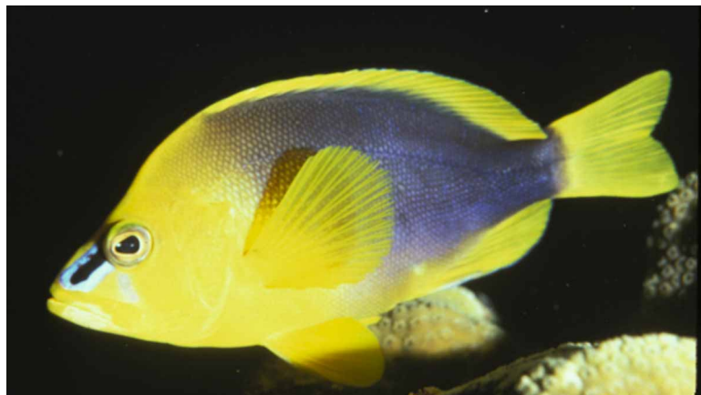
FIGURE 13. H. guttavarius , Jamaica.