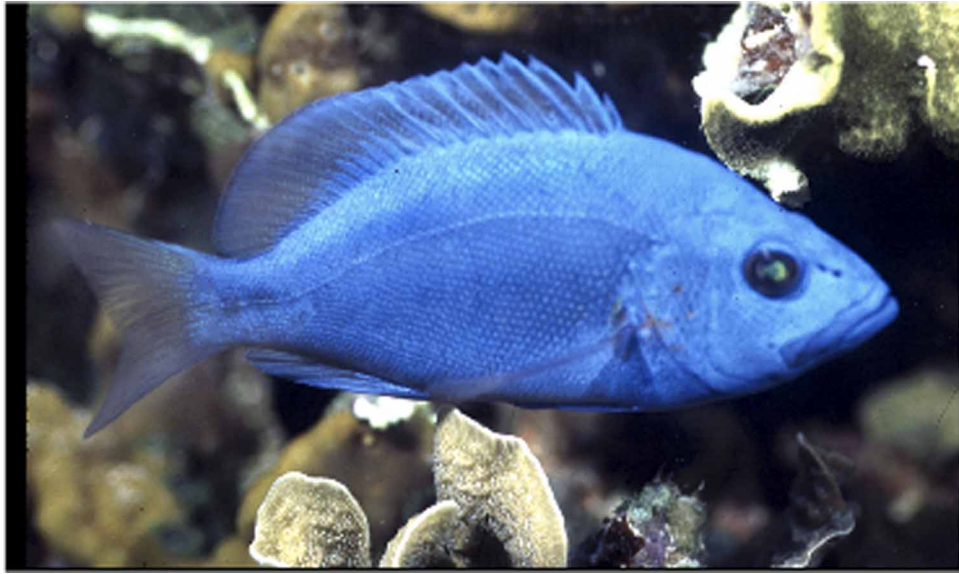
FIGURE 2. Hypoplectrus maya , Tunicate Cove, Pelican Cays, Belize.

sal spine 15.8 (14.3–17.0); base of anal fin 18.5 (13.7–22.6); longest anal spine 14.2 (13.3–14.7); longest anal ray 18.3 (16.2–9.8); caudal fin length 20.7 (14.2–26.6); pectoral fin length 28.9 (25.6–34.4); pelvic fin length 22.8 (20.6–24.3).