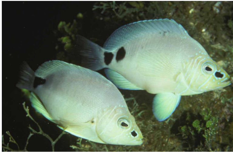
FIGURE 9. A mated pair showing the normal H. unicolor spot pattern on the caudal peduncle (lower right) and an individual with the double spot (upper). This was a mating pair, Discovery Bay, Jamaica.